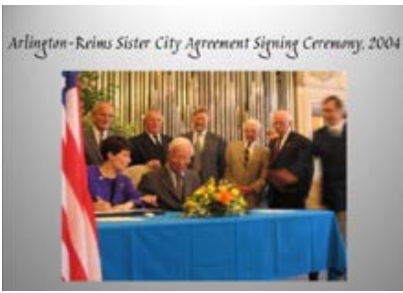
Arlington-Reims Sister City Agreement Signing Ceremony, 2004